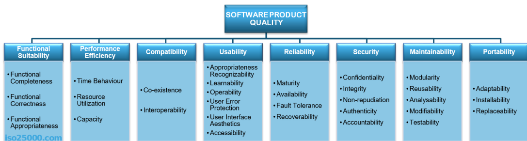
2. Figure Characteristics of software quality based on ISO/IEC 25010

I think that in software-intensive systems the ISO/IEC 25000 family should be heavily used, possibly in the early stages of software development in order to define the proper characteristics that guarantee the adequate level of security in the system. In this aspect security, reliability, usability and usability characteristics are key to achieve the expected level of security.