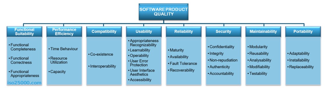
2. Figure Characteristics of software quality based on ISO/IEC 25010

I think that in software-intensive systems the ISO/IEC 25000 family should be heavily used, possibly in the early stages of software development in order to define the proper characteristics that guarantee the adequate level of security in the system. In this aspect security, reliability, usability and usability characteristics are key to achieve the expected level of security.