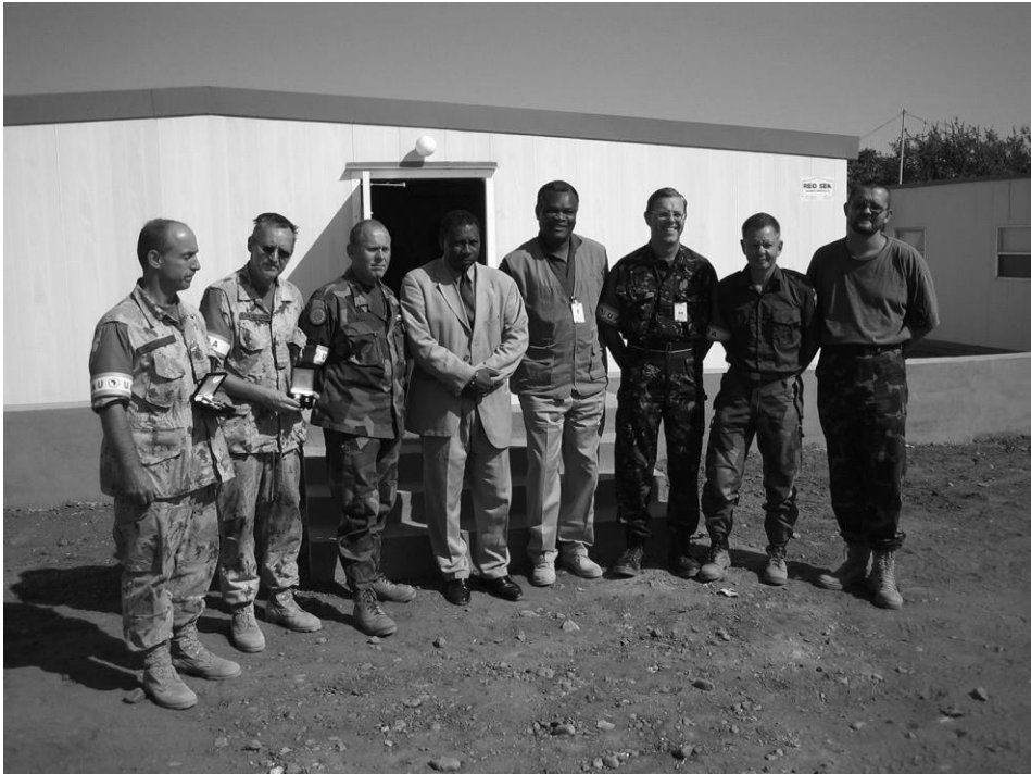
3 figure Edited by the author based on [23]