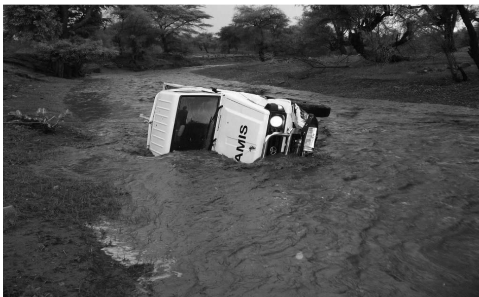
1. figure Edited by the author based on [21]