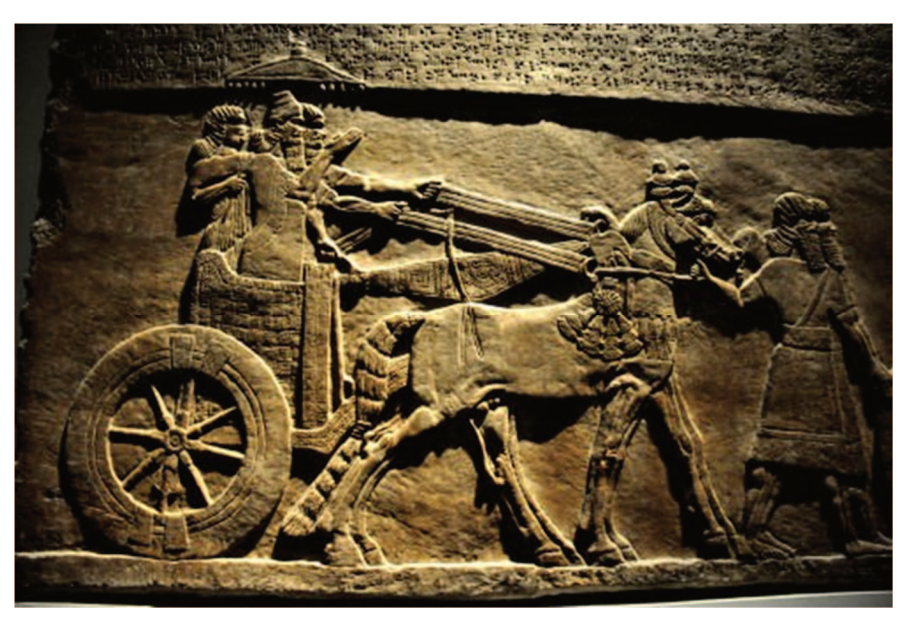
Figure 3. Chariot

The spear was the main weapon, as it could penetrate any armors with extreme accuracy. Most known spear was the sarissa. It had double length compare to the spear. It was also very useful against cavalry.