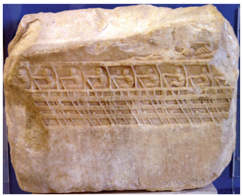
Figure 4 The Greek pentekontors engraved in stone Photo credit: Ancient Greek ships [9]

Ballista was a crossbow with a stand for accuracy. It is a siege weapon what shot huge object to take out a large chunk of an arms. During Dionysius, the Greeks developed the torsion catapult . Its missiles usually were stones or bolts, so they had enough force and power to weaken or even breach the walls. The intention was not necessary to destroy them, but rather to make the city surrender. For machinery, the chariots and siege engines - e.g. "Trojan horse" – also were used for forced starvation and ultimate treachery. (Chariot shows in Fig.3) The chariots although utterly ineffective in mountainous terrain was used in some circumstances. It was usually drawn by two horses and carrying two passengers. (A driver and a warrior) Its construction was generally bronze-plated wood. Ancient Greek (3) biochemical weapons means catapulted plaque by rotting animals or smallpox victims thrown towards the enemy. Based on some scholars they also tipped arrows with snake venom. Spartans used Sulphur with flame providing poison gas.