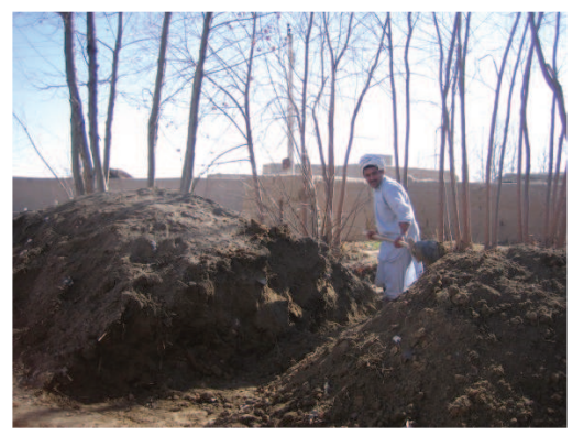
Photo 4: Composting in Dehrazi, Afghanistan, 2007

The process consists of three main phases: the decay of easily biodegradable substances heats the substrate above 50 °C within the first 4 - 5 days. At this temperature, slowly degradable macromolecules break down to more easily degradable substances, thus this phase is self-sustainable until sufficient oxygen is present in the pore volume of the substrate. As oxygen is gradually consumed, the temperature decreases to the mesophilic zone, 35 - 45 °C in the second phase. Aerobic reactions slow down and – in parallel with it – anaerobic reactions dominate in the sub-spaces where oxygen is missing. Without aeration, this phase may last 2 - 3 months. Stable humus precursor molecules build up during the last, "ripening" phase when, while the decay of unstable substances ceases. The whole process can be accelerated with artificial aeration, either by regularly mixing the substrate or by forcing air through it. The optimal substrate has 40 - 60% moisture content and a C/N ratio between 25:1 and 50:1. Composting is appropriate to treat wastewater sludge with carbonrich additives, such as straw or solid organic wastes. Simple variants of this technology, as shown on Photo 4, may then be considered for use in camp conditions, especially if it is linked to solid organic waste treatment.