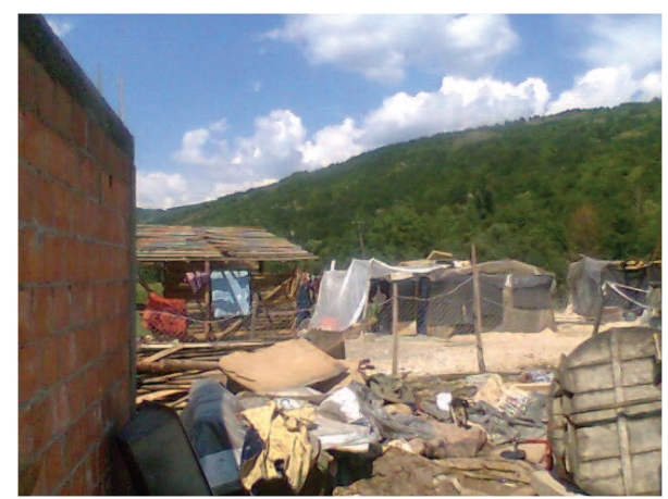
Photo 1: Blazevo IDP camp, Sandzak province, Serbia, 2008

"Military bases resemble small cities and face similar sustainability challenges" - as concluded in the US Army report on transition to zero carbon emission [1]. This is why permanent military bases are either connected to neighbouring urban sewage systems, or they have their own wastewater treatment plants [1], [2]. Likewise, large permanent refugee camps are sometimes provided with treatment facilities[3], [4], or they are connected to the neighbouring sewer system, like the Kosovo IDP camp "Blazevo" near Novi Pazar, Serbia, as presented on Photo 1.