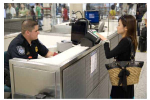
Figure 10: US-VISIT's innovative biometric technology enables officers to efficiently verify

use of name databases alone, particularly since persons will not be able to claim another's identity or fake travel documents. All the stored data will be safely stored, and it is just available only for the authorized and official usage, that international travelers are who they say they are and do not pose a threat to the United States. [19]