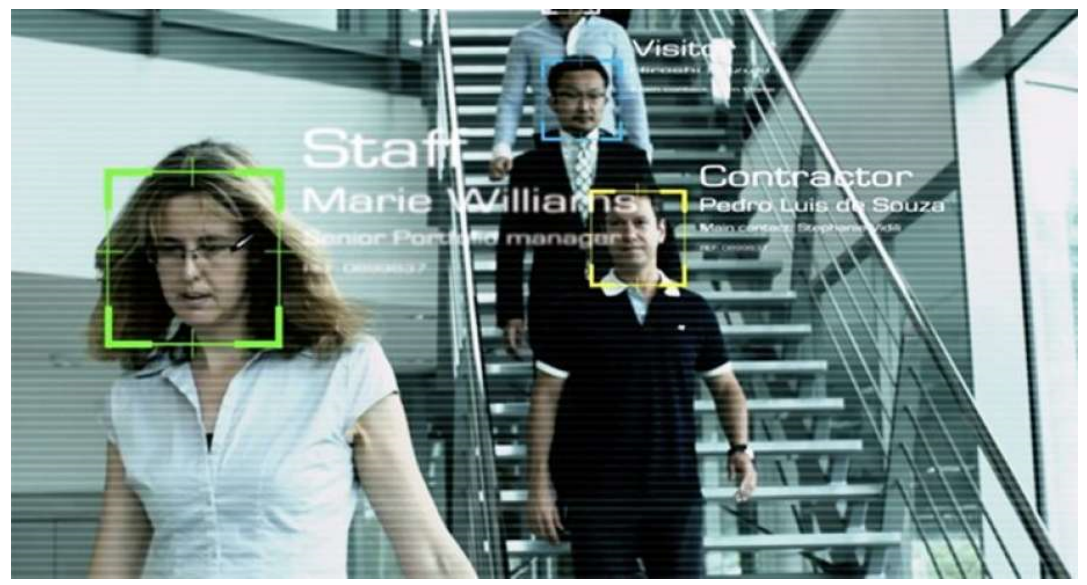
Figure 11: Biometrics boom at the airport: Using fingerprints, facial scans to enter clubs, get on planes

On March 2018, British Airways brough its biometric identification gates to three more US airports. Biometric identification gates were expanded to New York (JFK), Miami (MIA), and Orlando (MCO) airports. These "biometric e-Gates," which have been in trial at Los Angeles International Airport (LAX) since November 2017, use facial recognition to match flyers with their passport, visa, or immigration photos and can remove the need to show a boarding pass or identification when getting on a plane. Lufthansa has started using facial scans to permit passenger self-boarding at Los Angeles International. [24]